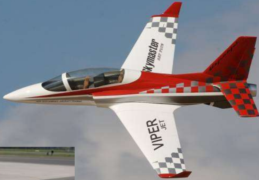
86 inch Viper Jet from Skymaster