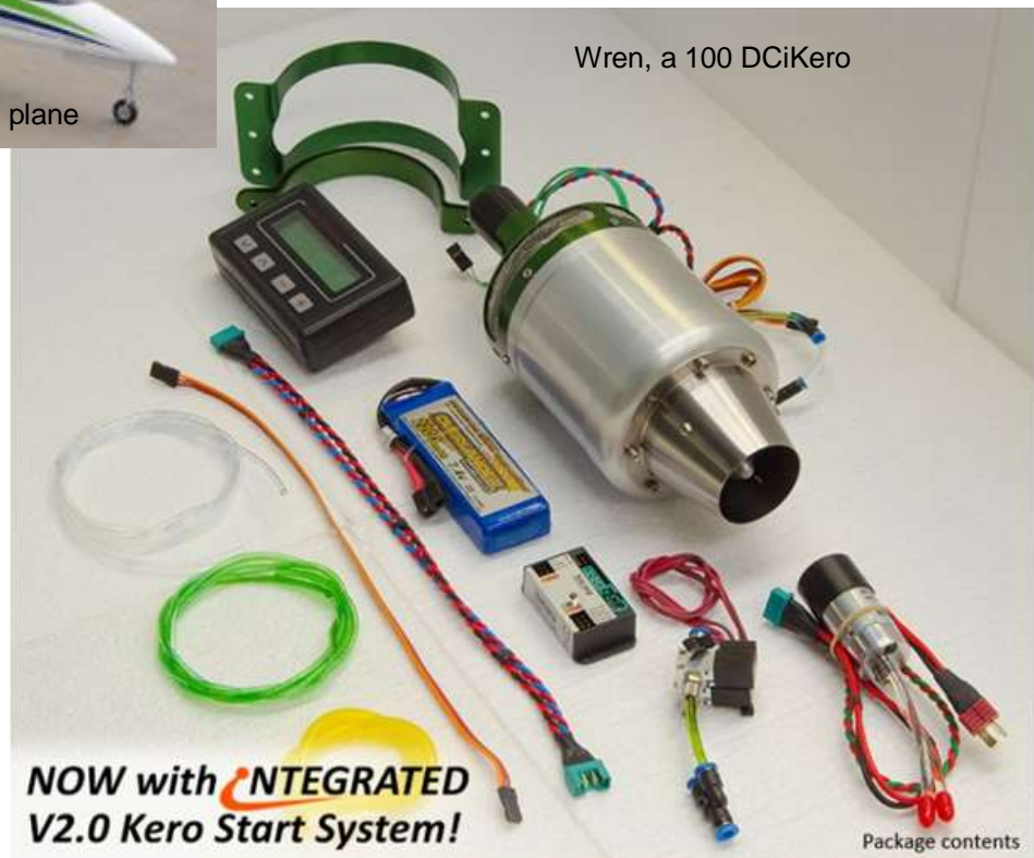
Wren, a 100 DCiKero

Can't wait to see it fly, but not at Christian Academy field!