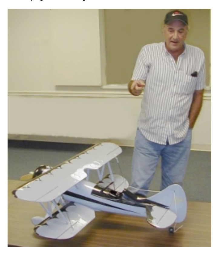
The meeting was adjourned at 9:00 PM.

The next meeting is scheduled for October 1, 7:30 PM, at the Marple Library.