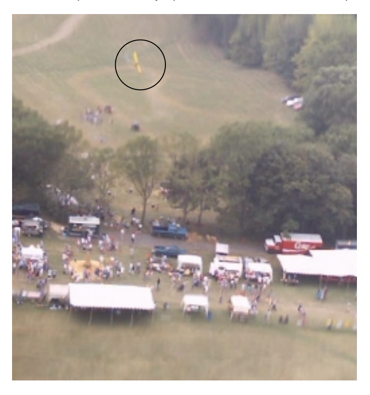
Our flight demo went from 1:30 to 3:30 PM without incident.

Many people attending the event walked around the static displays asking questions about RC, the Propstopers, and commenting on the models shown and flown.